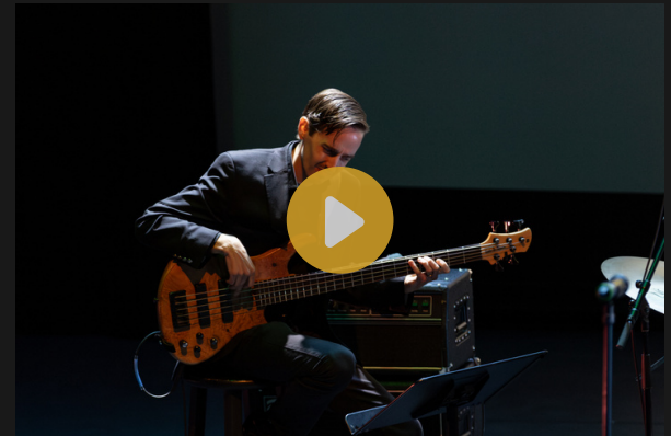
Heart Passage at REDCAT