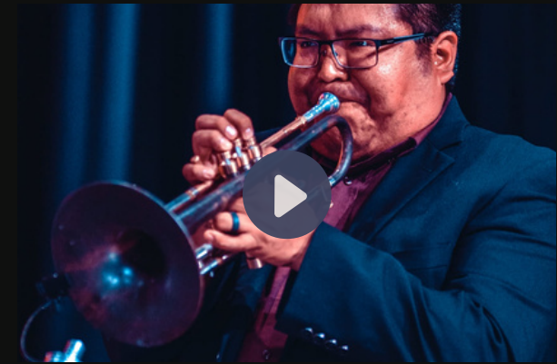
Iron Horse Gallup