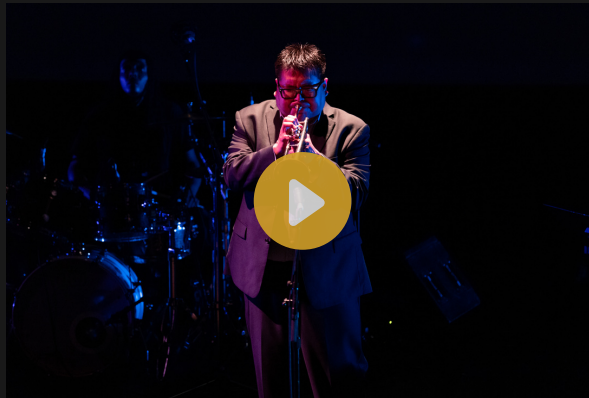
Groove Warrior at REDCAT